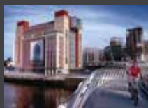
Baltic Centre, Gateshead