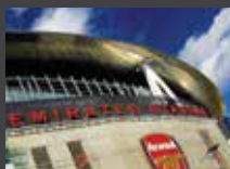
Emirates Stadium, London