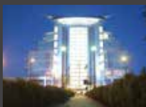
St David's Hotel, Cardiff Bay