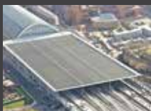
St Pancras, London