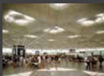
Passenger Terminal, Stansted Airport